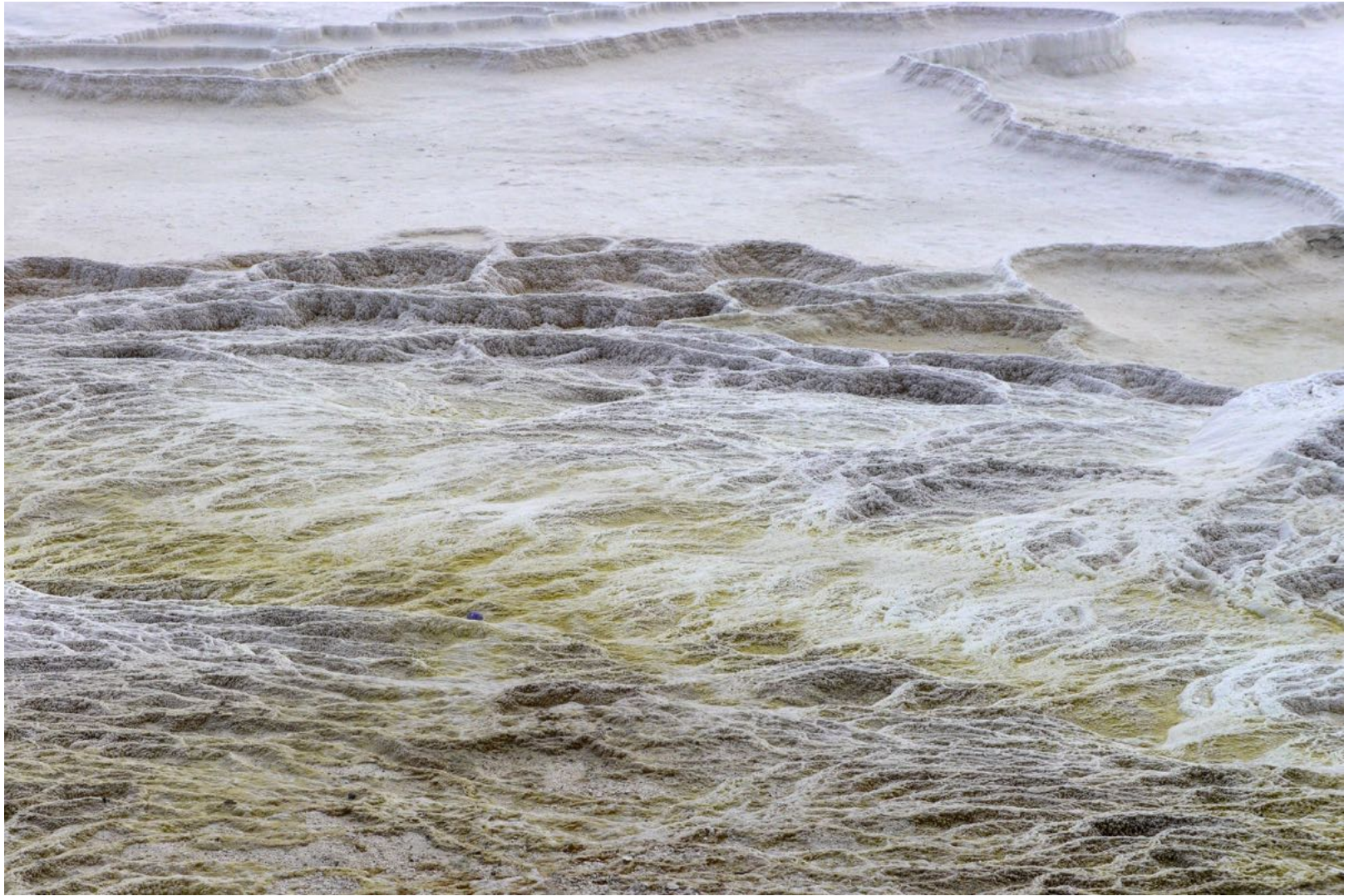
Tipping Points reached - photographic studies Arctic ice melt, vanishing glacier ... irreversible changes