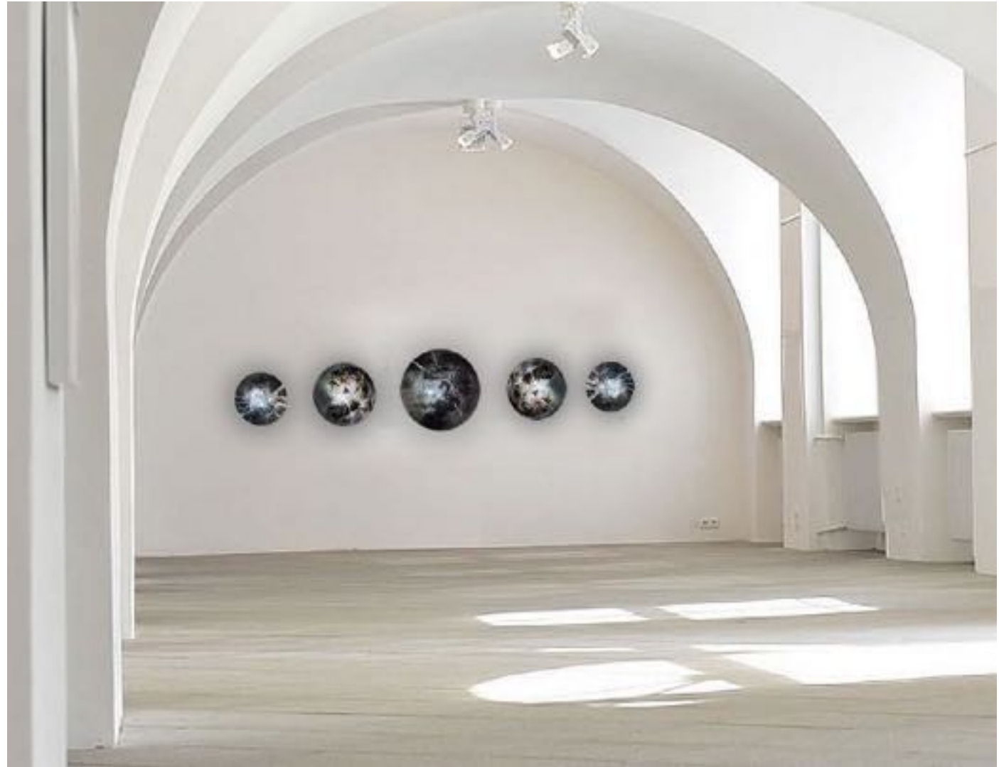
Sleeping on Broken Glass - Size of the Tondis Ø 20, 30 40 cm - Technique: Oil on Canvas