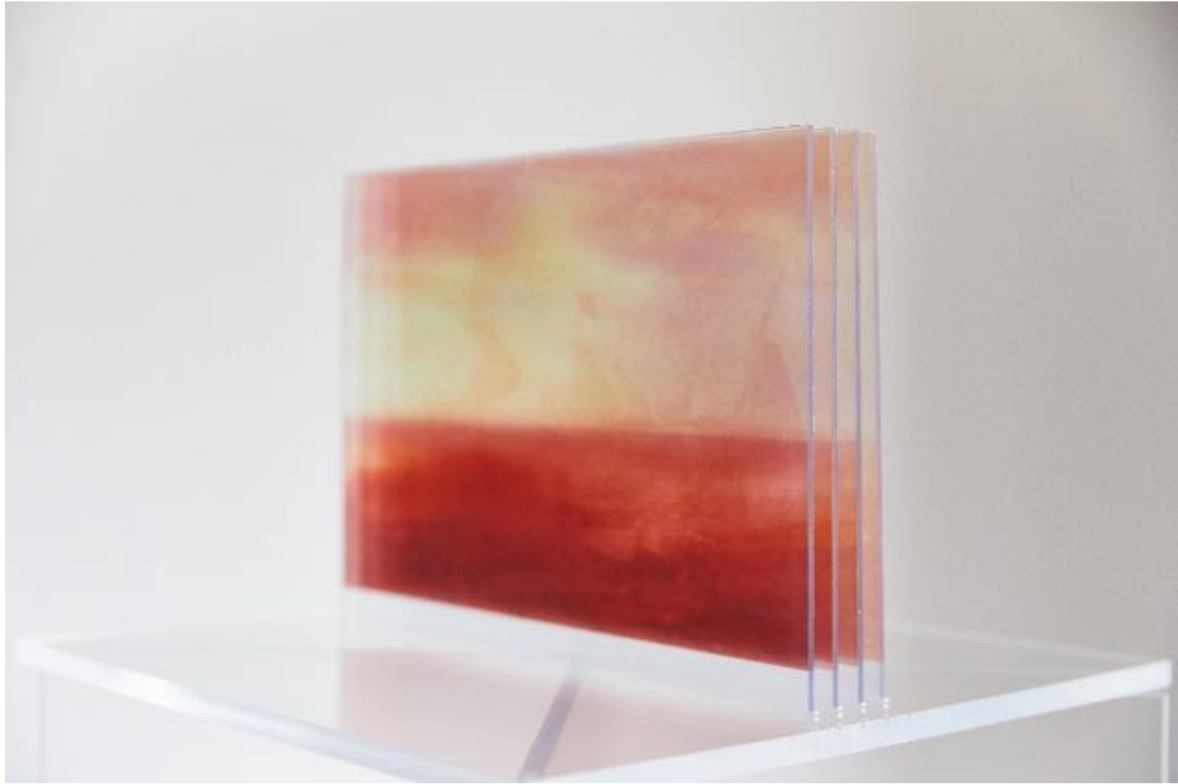
Plexiglass object 2022, approx. 40x40 cm - height: 120 cm