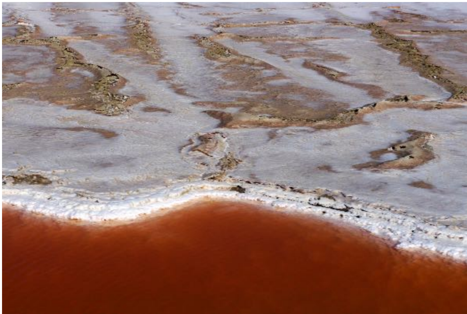
Tipping Point Salt Fields 160x90 cm - ltd. Edition Fine Art Print - Diasec Plexiglas

A Closeup of a small puddle creates a view like flying above a huge landscape - it's a kind of „perspective jump“. Like the saline in this picture some glaciers, lakes or sometimes snow show also marks of bloody reds. Looking horrible in the first place, it harmlessly is caused by iron oxyde or algae. The feeling you get is a question of perspectives - a scientist has a differnt view than a screenwriter on this phenomenon.