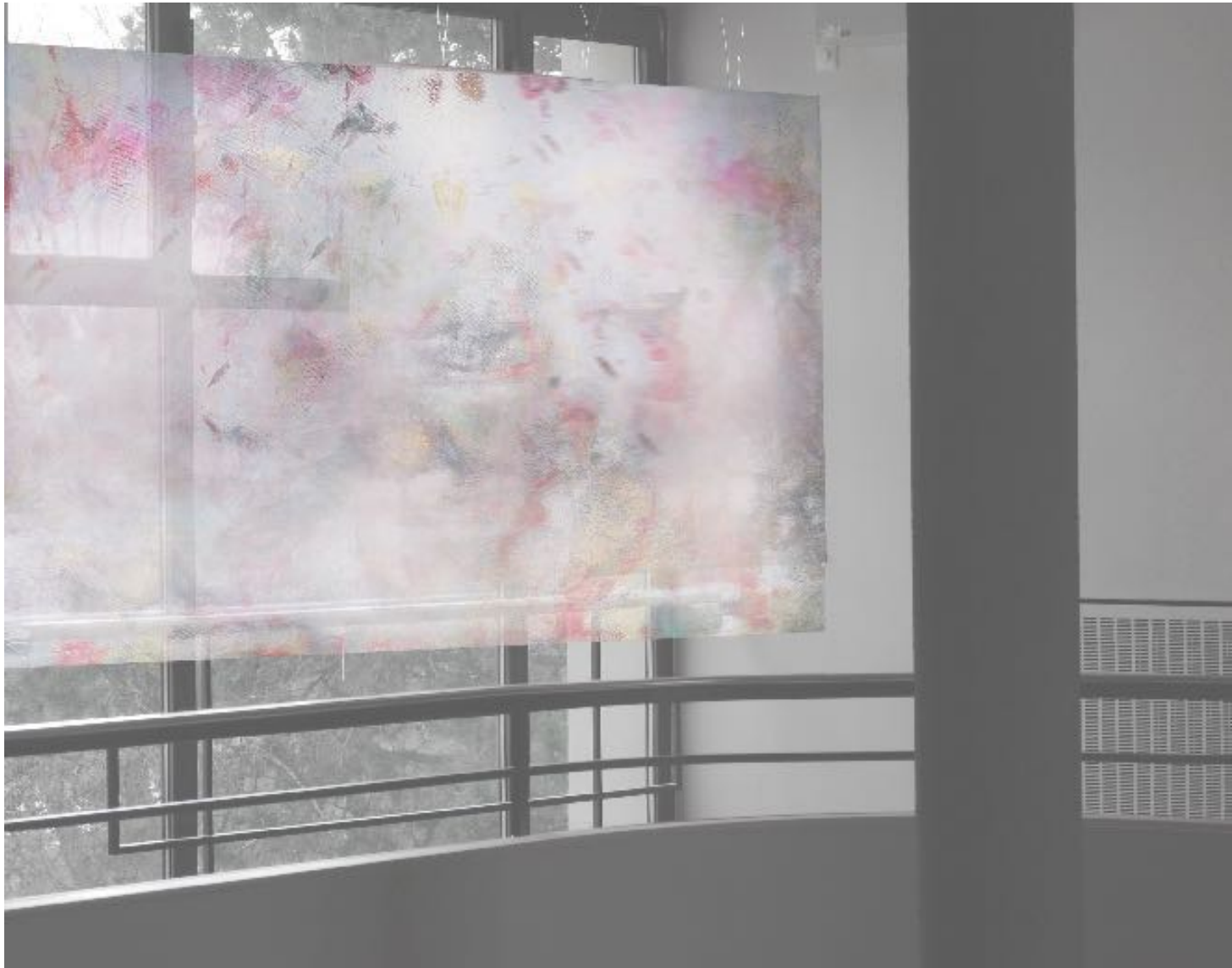
Virtual Test Installation: Transparent Print on Organza